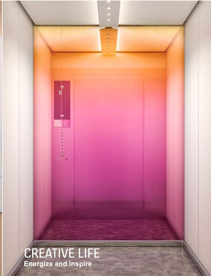
CREATIVE LIFE Energize and inspire