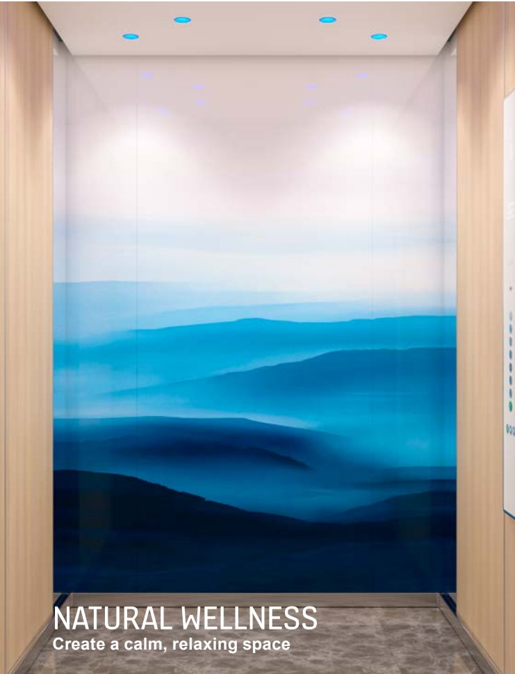
NATURAL WELLNESS Create a calm, relaxing space