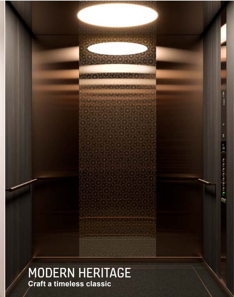
MODERN HERITAGE Craft a timeless classic